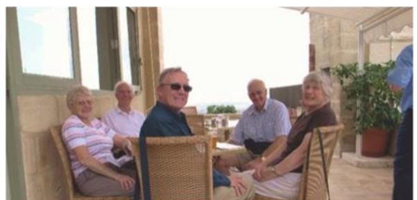
A break for tea in Malta