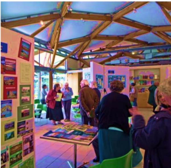
At Alnwick Gardens

In March we held an Exhibition in Alnwick Gardens. At that time, the Pavilion Hall at Alnwick Garden was available free of charge for voluntary organisations and so we took advantage of a funding grant from National u3a to put on an exhibition.