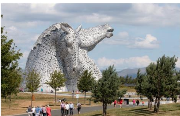
The Falkirk Wheel and Kelpies Outing