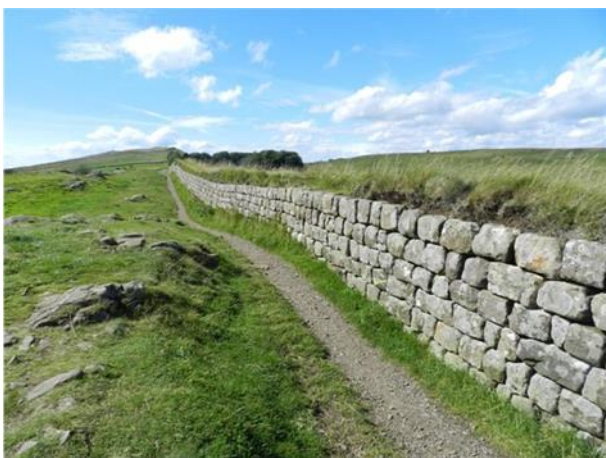
Hadrian's Wall, near to the Roman Army Museum

Of course, we did not ignore the Roman Wall – I remember an interesting talk at the Roman Army Museum where we were treated to a demonstration of weapons used by the army – nasty!