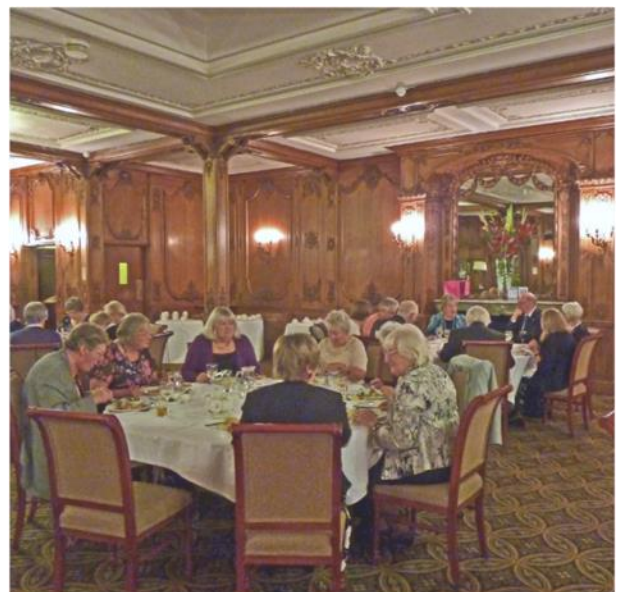
Dinner at the White Swan

Finally, in October there was a Dinner and a Buffet Lunch. We had a formal dinner with an after-dinner speaker at the White Swan in Alnwick. The following week, we had a buffet lunch after our AGM, with a celebratory cake.