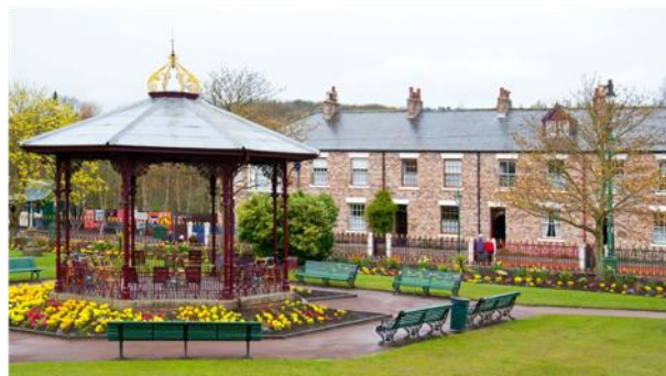
The Beamish Outing