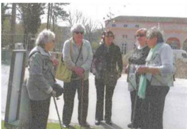
u3a group at Potsdam, outside Berlin

After we had glimpsed the main sights, a small group or even an individual, if they so wished, could go back and visit places which were of particular interest. I liked the art galleries on the Albert Docks and the old and new cathedrals.