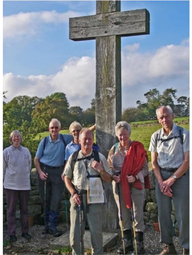
A successful conclusion to St Oswald's Way

A seascape walk from Coldingham Bay and, by contrast, some of us remember a very wet and boggy walk to Blawearie (perhaps we read the directions incorrectly). St Oswald's Way was also followed.