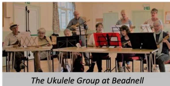
The Ukulele Group at Beadnell

A poppy exhibition in the church, a village trail, a picture quiz and a performance from Alnwick u3a ukulele group.