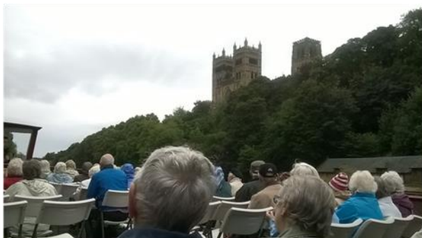
The Durham 2014 Outing