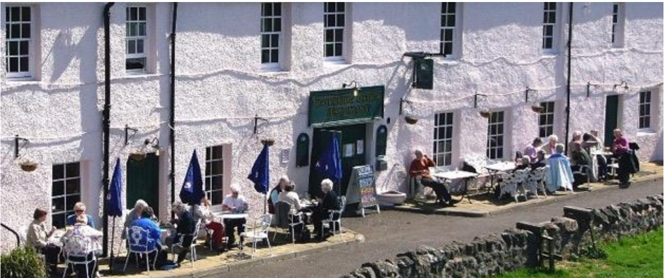
In May 2006, our members seem to have taken over the Waterside Bistro in Haddington

At the end of 2003, a small number of us got together to start an Architecture Group. We decided to spend the winter months sharing our knowledge of buildings and, in the summer, to visit places of interest. This has happened until joint activities ended in March 2020 because of Covid. Our initial outings were by car, but our April 2005 outing was so popular that we hired a minibus. But it wasn't big enough, so we had to take a car as well. Since then, we have usually had a coach.