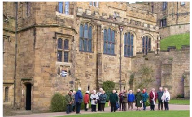
Waiting for our guide to show us around Durham Castle in April 2005

Then, of course, we have had meetings. Every November we have met to review the year and plan for the following year. In the other winter months, we have had presentations from some of the members, or we have watched and discussed a DVD.