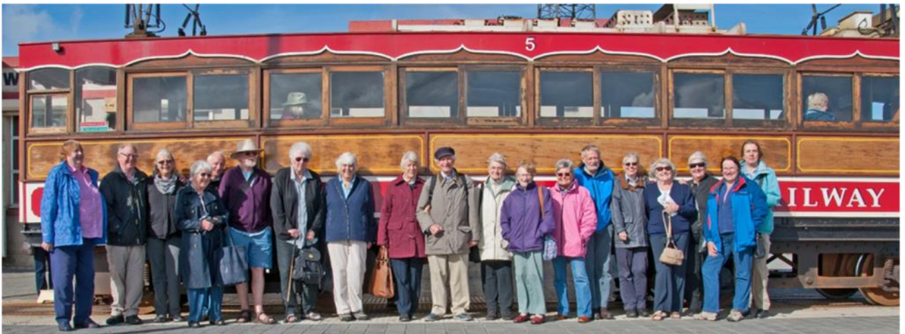
Waiting for the railway at Snaefell, Isle of Man