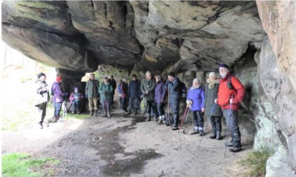
St Cuthbert's Cave Walk

Some of our walks included a magical walk from Hartside Farm in Ingram Valley, a breath-taking Roman and Reivers walk from Alwinton, beautiful scenic walks along St Cuthberts Way, (the Scottish stretch was excellently maintained) and we received a certificate for completing the Way.