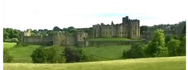
Alnwick Castle – Home of the Percy Family

Our aim was to cover a wide range of topics, local, national, and international. Surrounded by so much history in Alnwick, it seemed obvious to begin our research with the history of the Percy family.