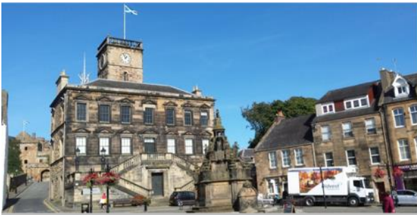
Linlithgow & Hopetoun House, west of Edinburgh - September 2016

Halls and Georgian houses. We have been to most of the houses open to the public, and some only open to groups, within reach of Alnwick.