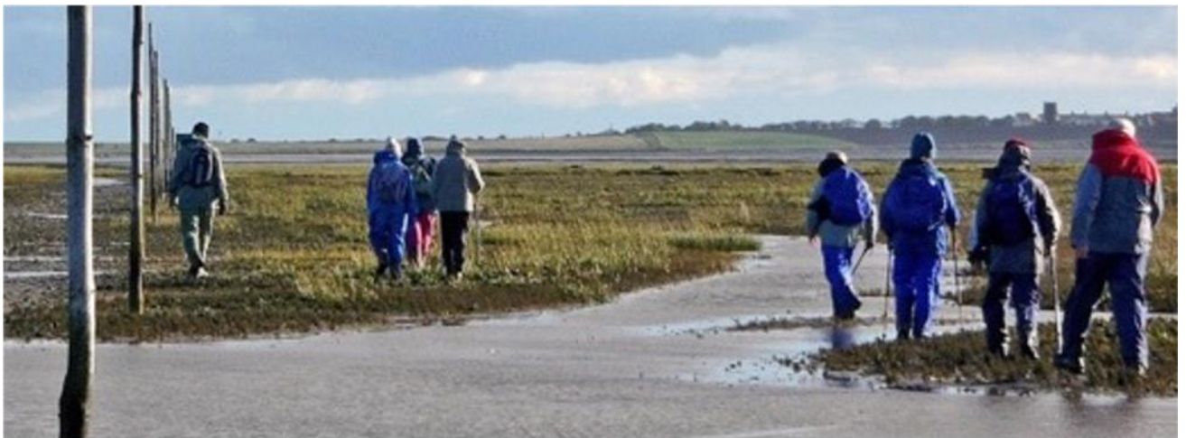
The Pilgrim's Way to Holy Island

The walking group started in the earliest days of the Alnwick u3a. A small group of members joined in whenever and wherever they chose to walk. The lovely coast of Northumberland has been walked and the stunning countryside has been explored but there is still much more to discover.