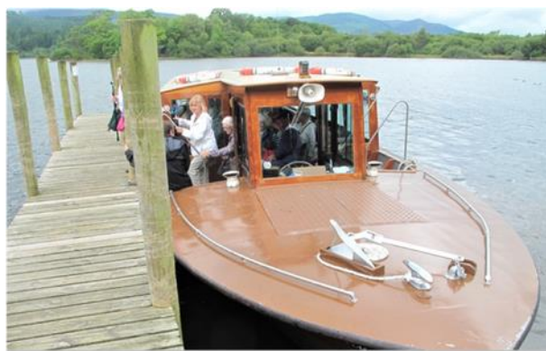
The Keswick Outing