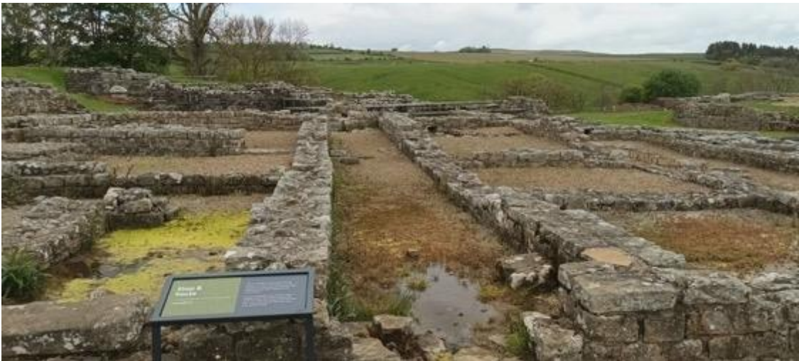
Butchers shop and house