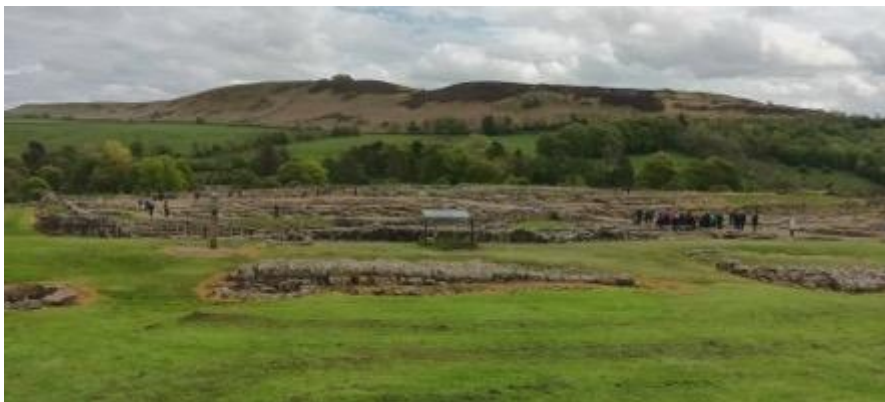
View of Vindolanda site