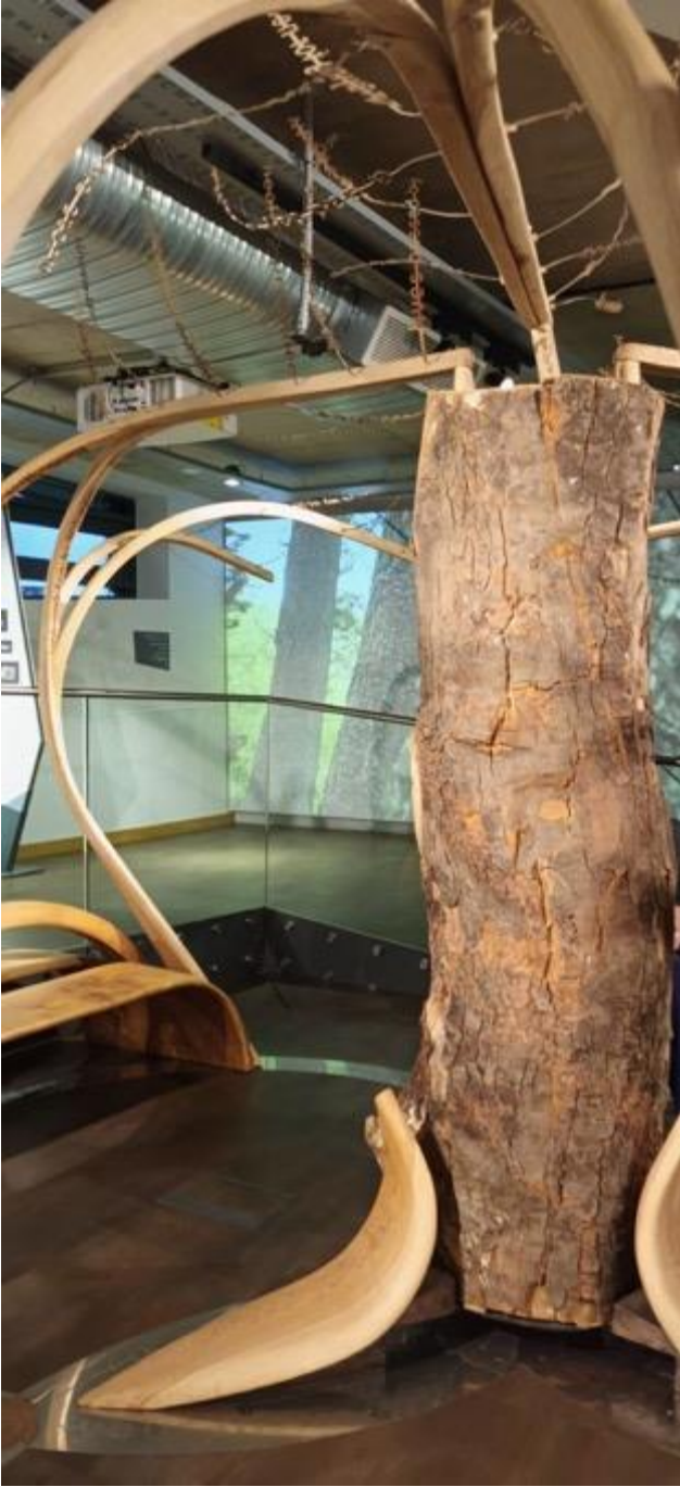
Sycamore Gap tree sculpture