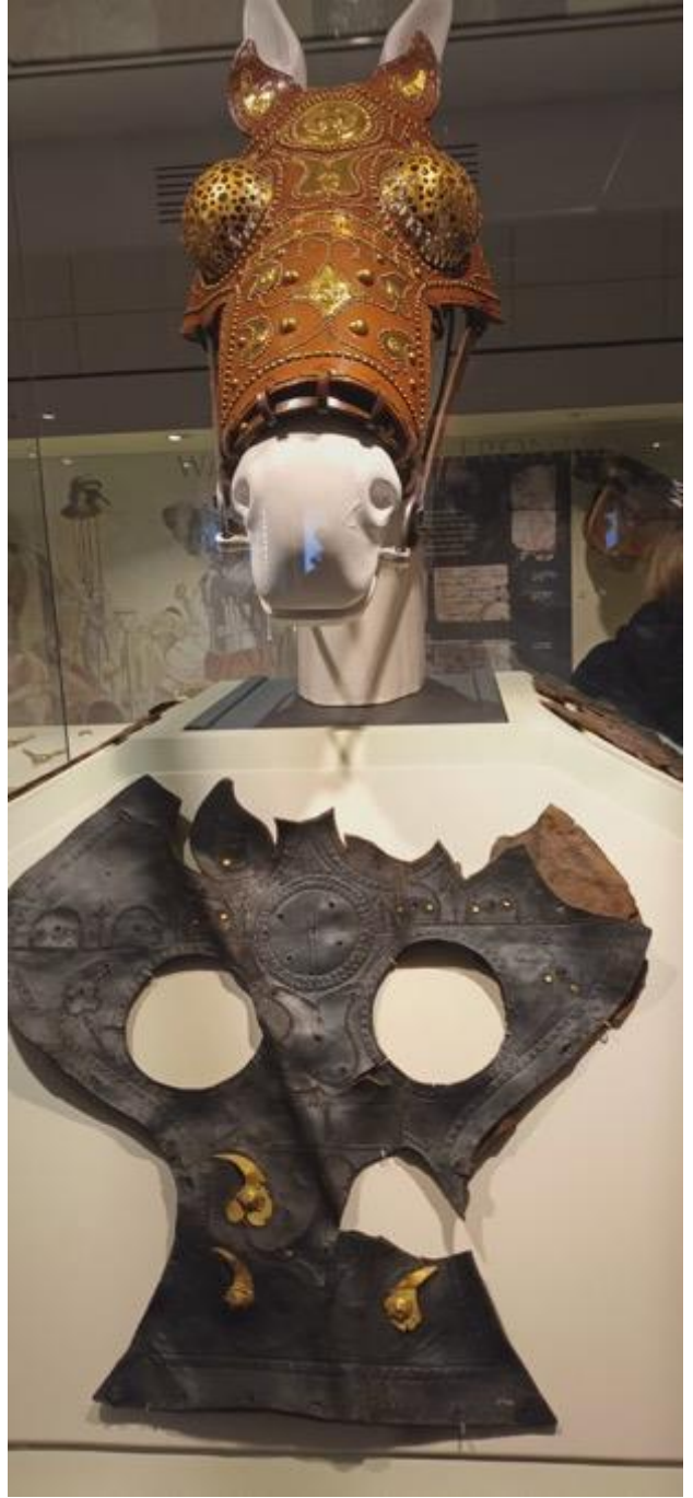
A Horse's Chamfron