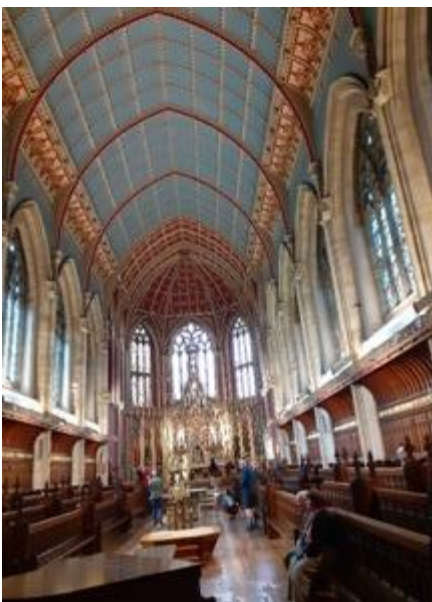
U3A Recitals in St Cuthbert’s Chapel - Ushaw Historic House

At midday everybody met in the magnificent refectory for a very well-organised packed lunch-style break. The superb setting of Ushaw Hall – especially for the recitals in St Cuthbert’s Chapel – enhanced the occasion, and I believe the regional committee are considering a repeat.